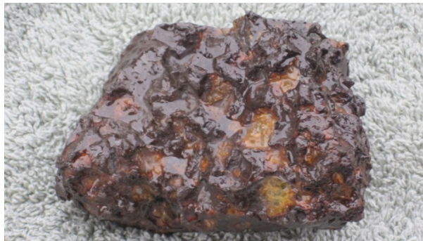
Iron-stony meteorite from the Atacama Desert, Chile