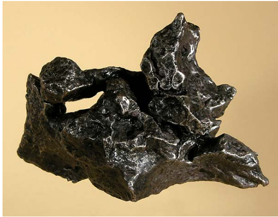
Iron meteorite from Campo del Cielo in Argentina