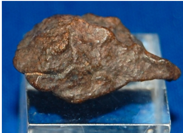
Stony meteorite from Algeria