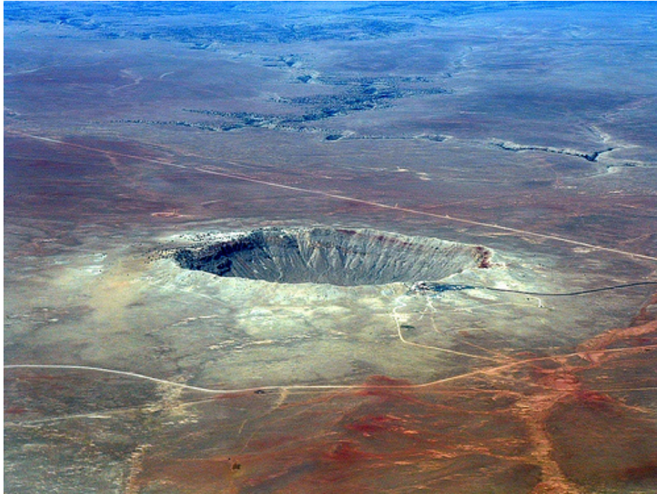
Banger crater (or Meteor crater), Arizona, USA