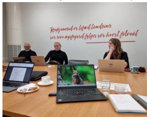
Kick Off Meeting of REGENERATE Project

The REGENERATE Project, funded by Interreg Northern Periphery and Arctic and Cavan County Council is centred on Regenerative Tourism in the Northern Periphery and Arctic for building resilient communities and preserving unique heritage.