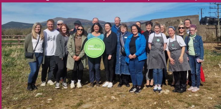
Ballyhoura Country Visit Cuilcagh Lakelands Geopark