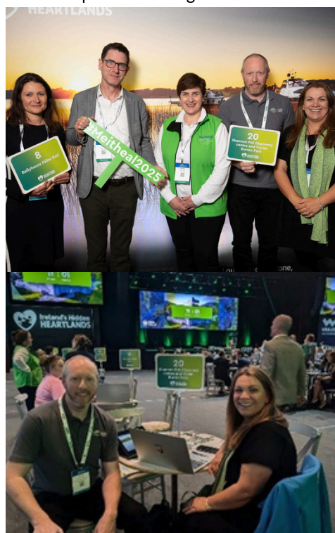
Geopark Attending Trade Shows

We look forward to working closely with all partners over the next 3 years, Visit Reykjanes Iceland , GeoCamp Iceland , Gold of Lapland Sweden , Karelia University of Applied Sciences and Olemisen Balanssia , Fermanagh & Omagh District Council , Tourism Northern Ireland and Fáilte Ireland .