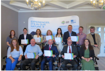
Sustainability & Regenerative Tourism Programme: 2024 Class

In collaboration with Cavan County Council, Fermanagh and Omagh District Council, Fáilte Ireland, and Tourism Northern Ireland, we are inviting tourism businesses within