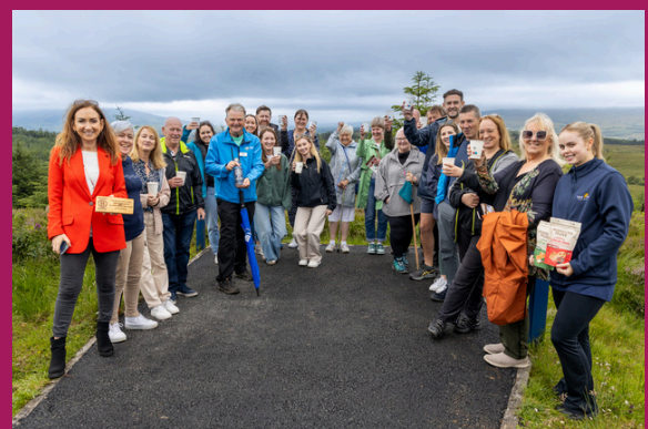
Participants enjoying drinks served by The Boatyard Distillery