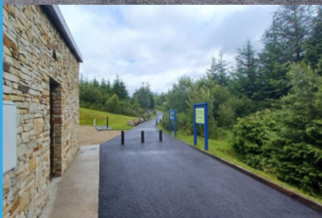
After Upgrade Works: Bound tarmac finish providing an accessible trail