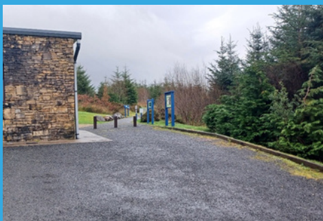
Before Upgrade Works: Gravel path not ideal for all users

These upgrade works were made possible through secured 2023 ORIS funding.