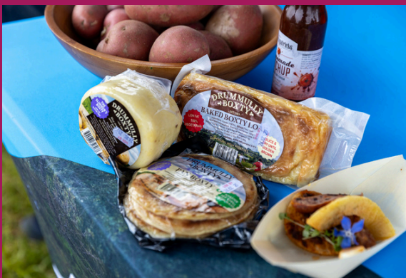
Delicious food served at Burren Bites: A Taste of Time