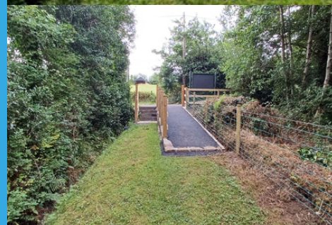
After Upgrade Works: Stairwell upgraded and a ramp created providing accessible access