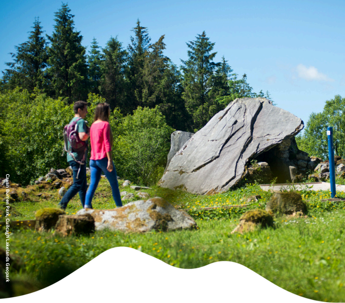
Cavan Burren Park, Cuilcagh Lakelands Geopark