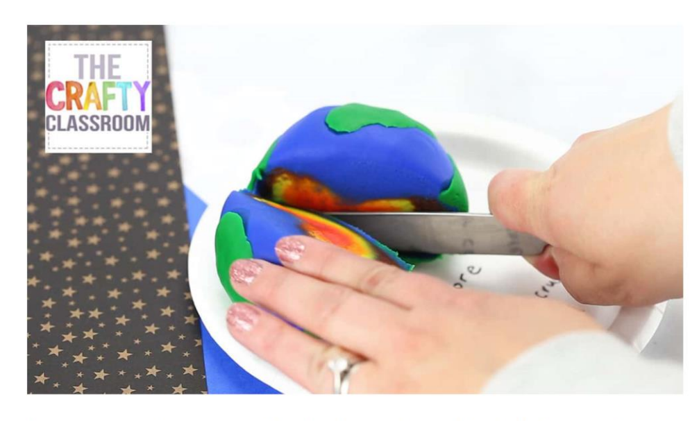
Break up bits of green to make land and press it into your earth to represent the continents. Smooth out the edges a bit to keep things round.